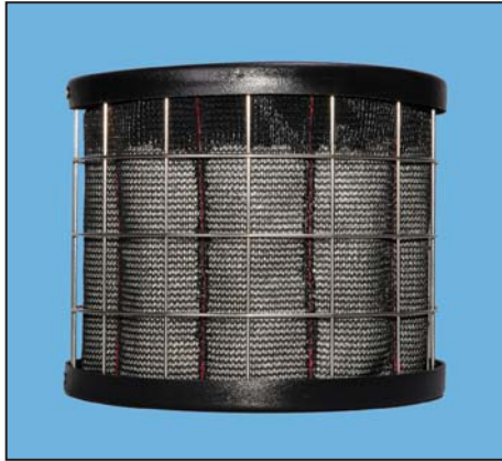
TRITON MEDIA CARTRIDGE